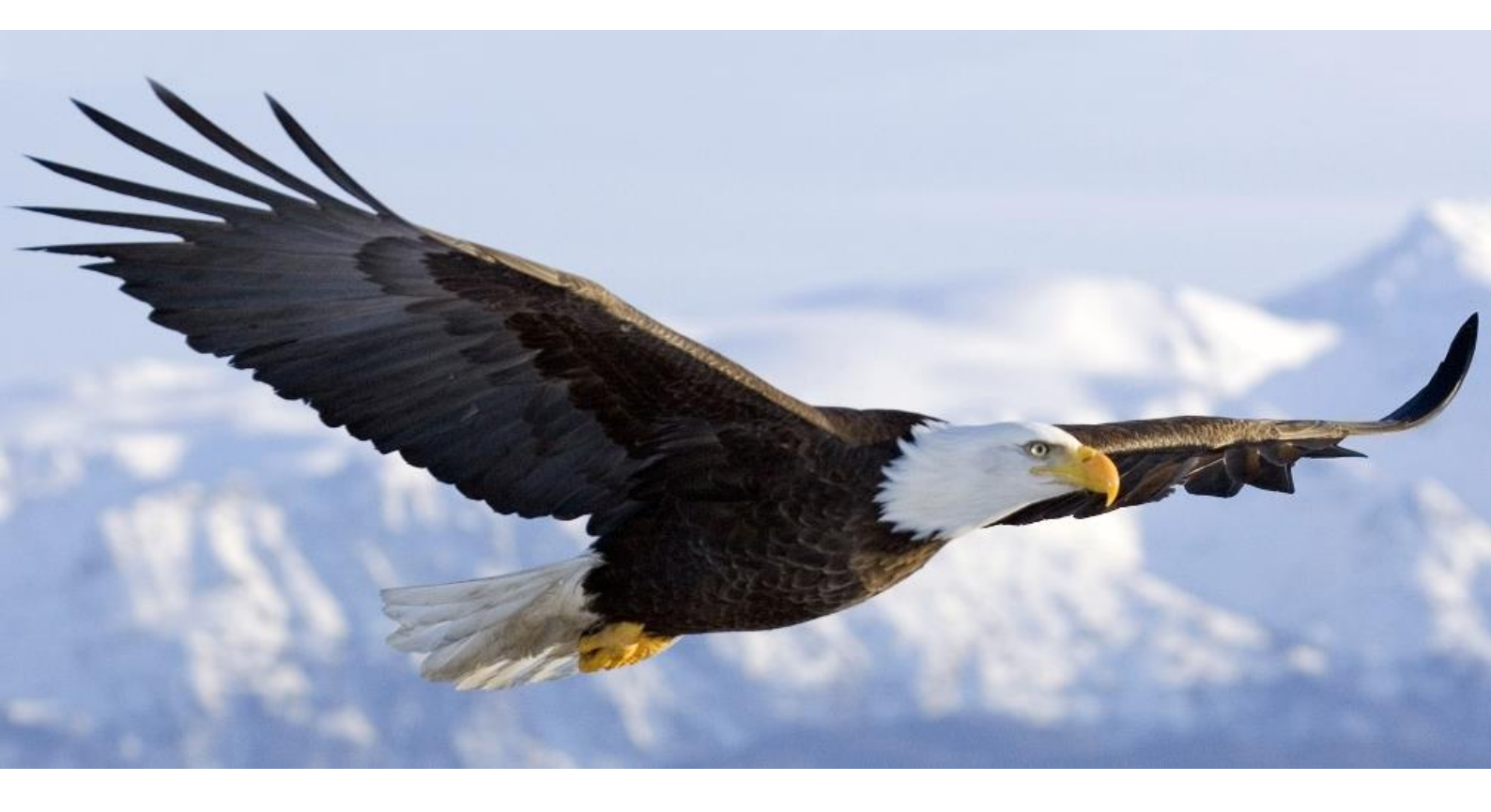
Q1 2019 - Opportunities - EUROPE