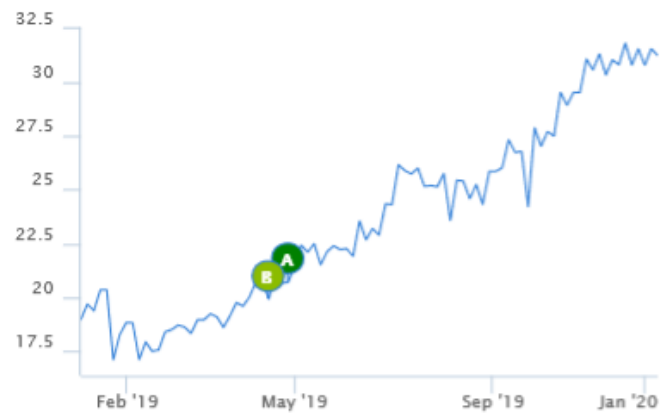
A Target (TGT) Rated on: 2019-03-29 | Since A: +53.97%