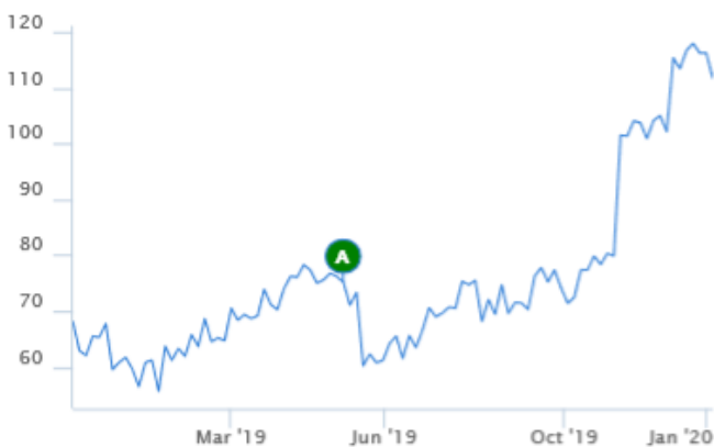
A Applied Materials (AMAT) Rated on: 2019-04-11 | Since A: +41.02%