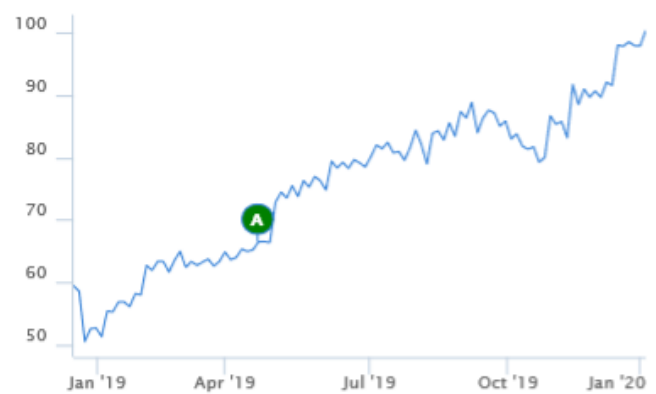
A Qorvo (QRVO) Rated on: 2019-05-09 | Since A: +48.56%