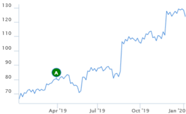
A Leidos (LDOS) Rated on: 2019-04-23 | Since A: +50.89%