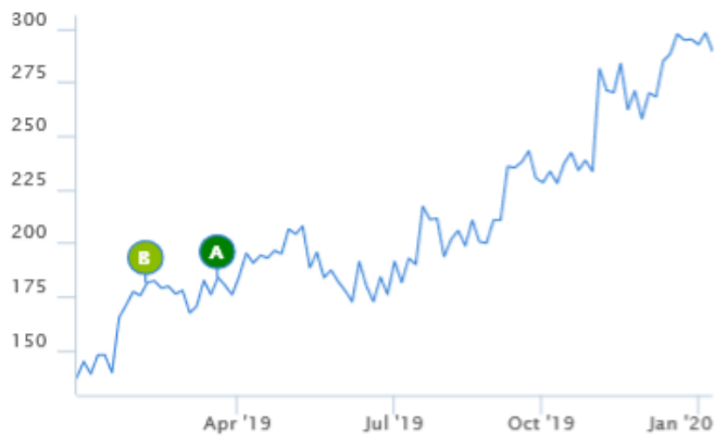
A Arconic (ARNC) Rated on: 2019-04-29 | Since A: +50.77% | Since B: +56.68%